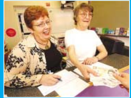
The Clivey Credit Union in Swindon